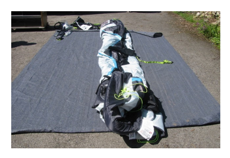
2. Measure the width of the bag up against the width of the folded awning to make sure the awning is going to fit.